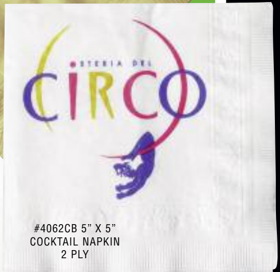
#4062CB 5" X 5" COCKTAIL NAPKIN 2 PLY