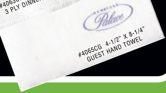
#4065CG 4-1/2" X 8-1/4" GUEST HAND TOWEL