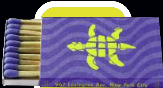
#1025 CELEBRITY SLIM 2-1/4" X 1-5/8" X 1/4" (20 PER BOX)