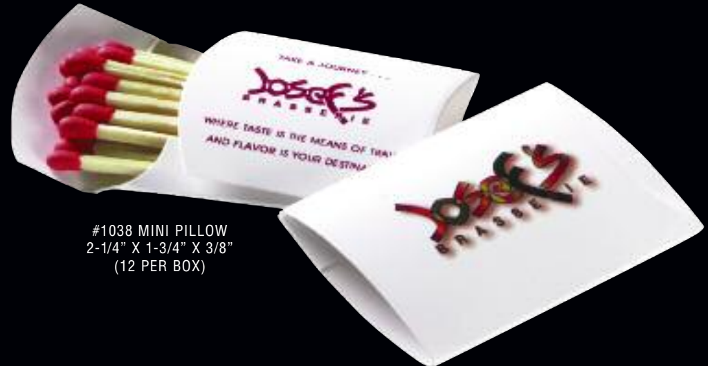
#1038 MINI PILLOW 2-1/4" X 1-3/4" X 3/8" (12 PER BOX)