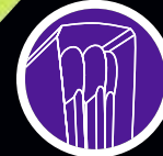
#2030 24-STRIKE 1-3/4" WIDE, DOUBLE ROW

NO CHARGE: YOUR CHOICE OF MATCH TIP COLOR ON WHITE OR BLACK STEMS.