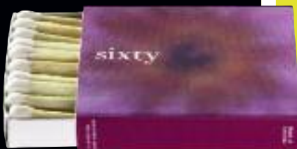
#1014 UNI 1-3/4" X 1-1/2" X 3/8" (22 PER BOX)