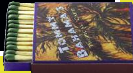
#1026 CLASSIC 2-1/4" X 1-7/8" X 3/8" (34 PER BOX)