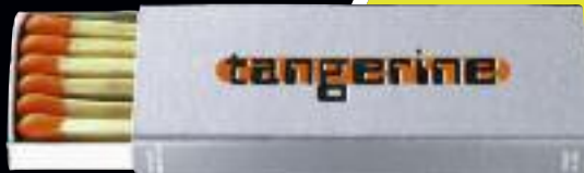
#1016 MADAME 2-1/4" X 15/16" X 5/16" (10 PER BOX)