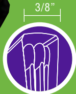
#2039 30-STRIKE 2-1/8" WIDE, DOUBLE ROW