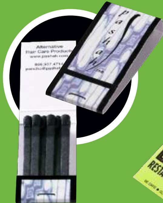
#2029 12-STRIKE 1" WIDE